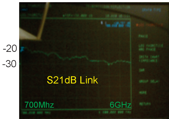
Link Data over Frequency

No evidence of multi-path can be seen either in the VNA link data display nor the real-time aut gain display. The reason is due to both the Tx and aut moderate gain levels and the path/ reflection(s) distance ratios. The real-time gain display show the absolute gain level with the horn and path loss frequency variations removed.